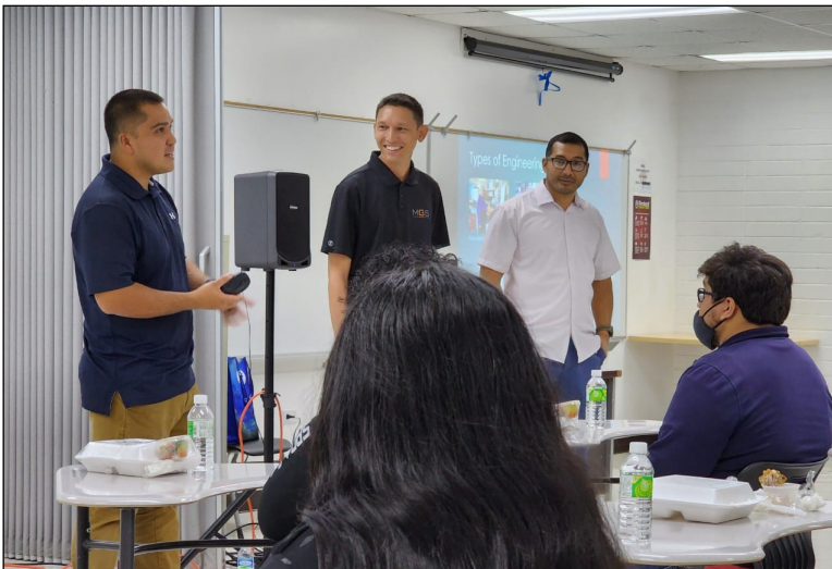
Engineers speaking to NMC students.