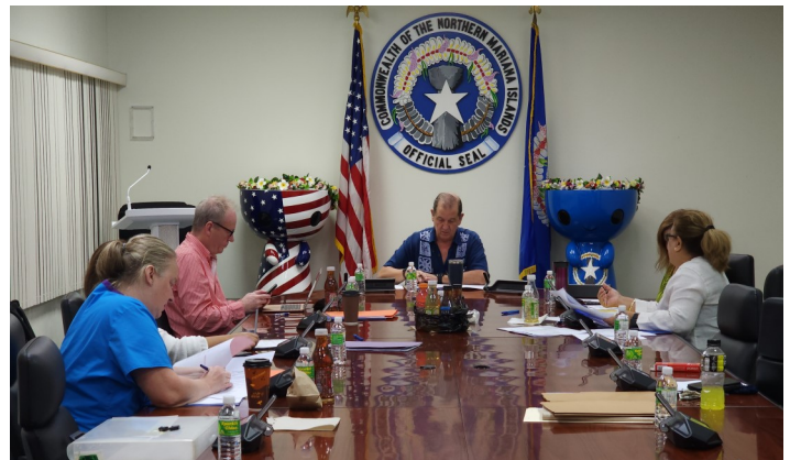
HCPLB at work during their monthly meeting.